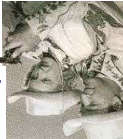
Roy Rogers and Dale Evans

Phone: 303-647-2311 Email: info@lostvalleyranch.com Web: www.lostvalleyranch.com