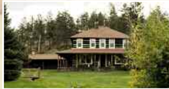
Original ranch house - circa 1882

The history of Lost Valley Ranch and the surrounding area is the story of the South Platte River. Five hundred years ago the South Platte country